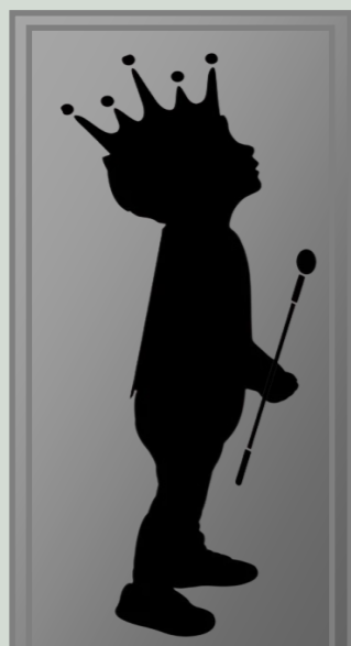
Straight after taking the silhouette