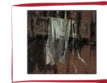
un lenzuolo, steso ad asciugare