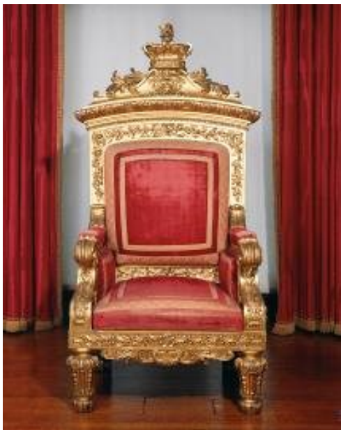
Dowbiggin & Co Queen Victoria's Throne 1837 Carved gilt wood, velvet RCIN 2608

This is the throne that was made for Victoria when at the age of nineteen, she was crowned Queen of Great Britain. Made of carved gilt wood, the throne chair is upholstered in crimson velvet and lacework. On the top rail is a carved crown and national emblems. The frame is elaborately decorated with oak and acanthus leaves and laurel with berries – all symbols of power, strength and elegance. On the back of the throne are the emblems of Great Britain – roses, thistles and shamrocks.