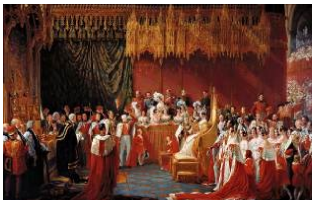
Sir George Hayter The Coronation of Queen Victoria in Westminster Abbey, 18 June, 1838 1838 Oil on canvas RCIN 405409

This painting captures the moment in the Coronation of Queen Victoria in Westminster Abbey when, after the Crowning, 'the people with loud and repeated shouts, will cry "GOD SAVE THE QUEEN": and immediately the Peers and Peeresses present will put on their Coronets' – in the Queen's words, 'a most beautiful and impressive moment'. The Queen is seated on the