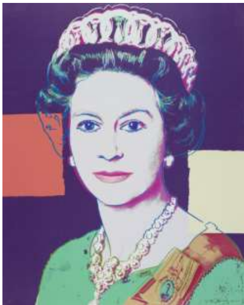
Andy Warhol, Reigning Queens (Royal Edition): Queen Elizabeth II of the United Kingdom , 1985 Credit: © 2024 The Andy Warhol Foundation for the Visual Arts, Inc. / Licensed by DACS, London *See usage restrictions on final page*