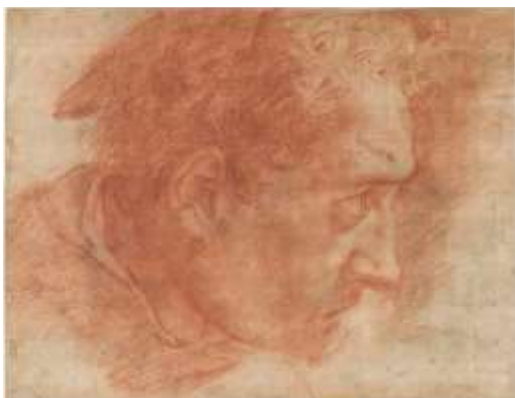
Polidoro da Caravaggio, The head of St Thomas(?) , c.1527