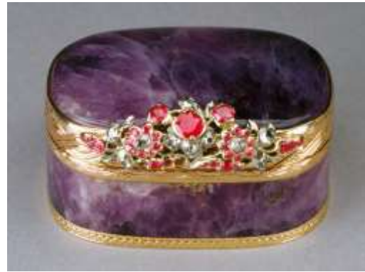
German, Snuffbox , c.1770