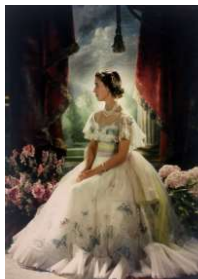
Cecil Beaton, Princess Margaret , 1949