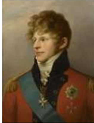
Paul Emil Jacobs, Augustus, Duke of Saxe-Gotha-Altenburg , c.1840-4 after an original of 1807