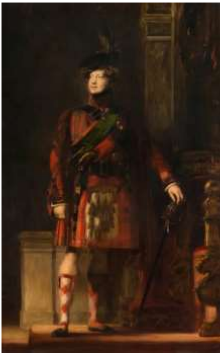
Sir David Wilkie, George IV , 1829