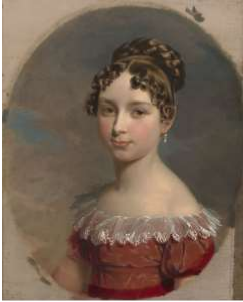
George Dawe, Princess Feodora of Leiningen , 1818