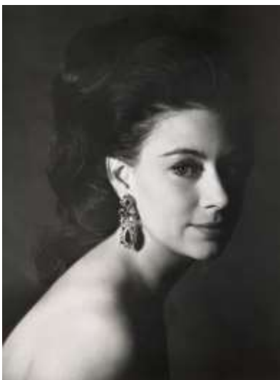
Snowdon, Princess Margaret , 1967