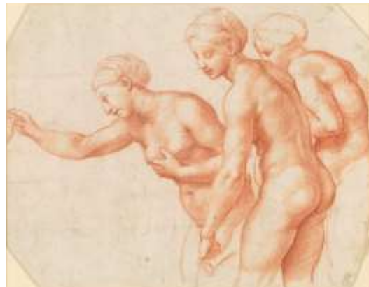
Raphael, The Three Graces , c.1517–18