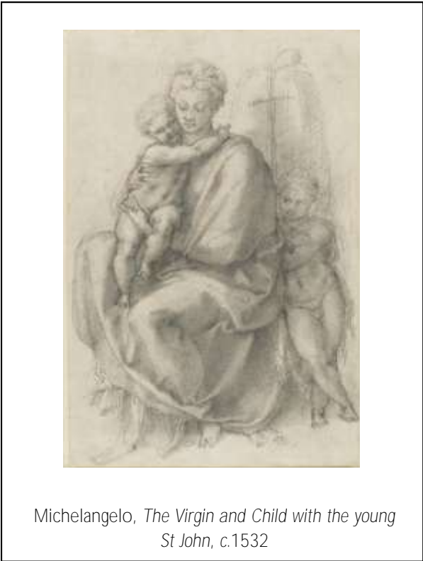
Michelangelo, The Virgin and Child with the young St John , c.1532