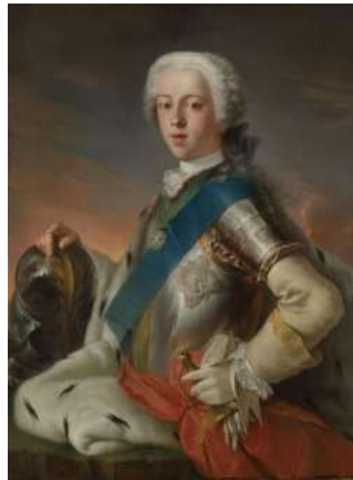
Louis Gabriel Blanchet, Prince Charles Edward Stuart , 1739