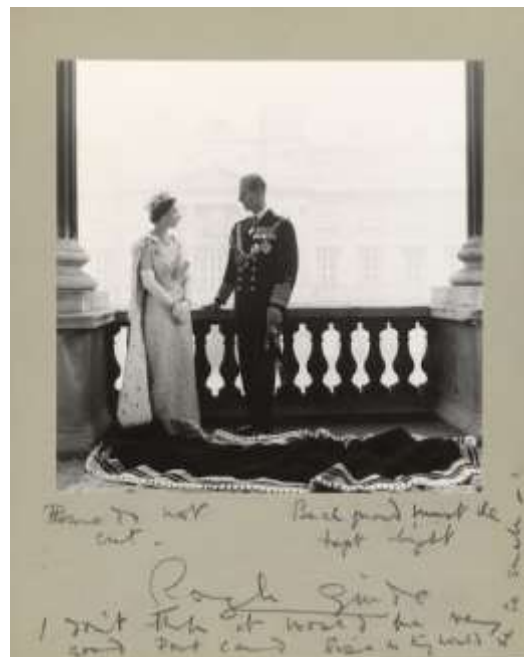
Antony Armstrong-Jones, 1st Earl of Snowdon, Proof with handwritten instructions, 1958