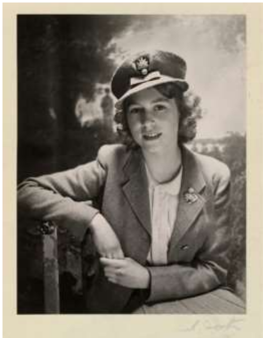
Cecil Beaton, Princess Elizabeth , 1942