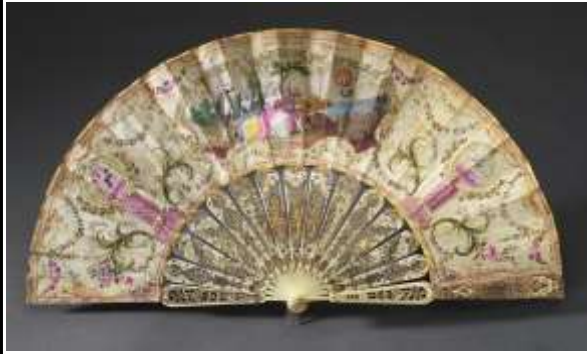
French, Fan depicting 'The Ascent of M. Charles's and M. Robert's Balloon, 1783' , 1783