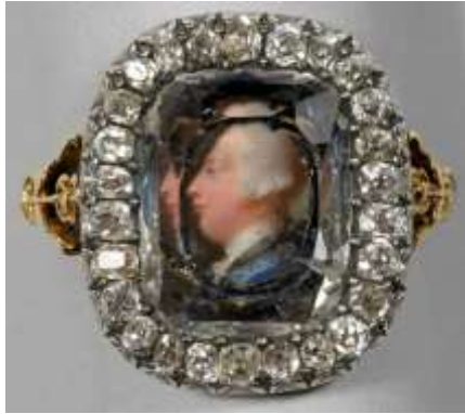
Jeremiah Meyer, Ring with a miniature of George III , 1761