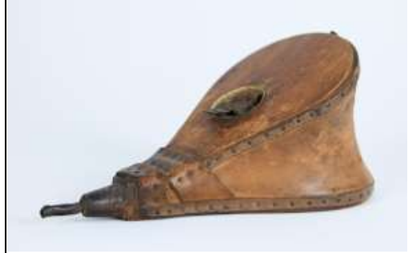
Bellows for hair powder

Images are available to download from Dropbox .