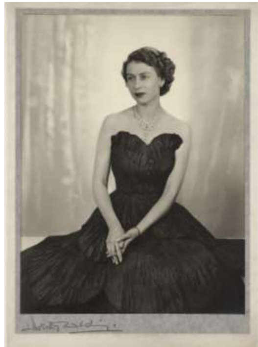
Dorothy Wilding, Queen Elizabeth II , 1952