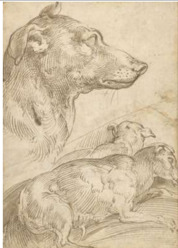
Parmigianino, Studies of dogs , c.1530–35