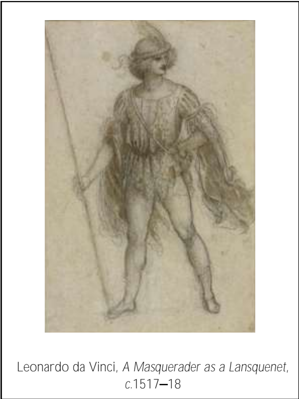
Leonardo da Vinci, A Masquerader as a Lansquenet , c.1517–18