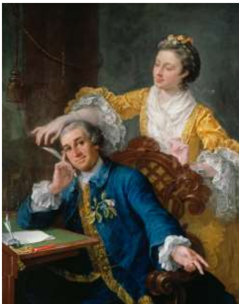
William Hogarth, David Garrick with his wife Eva-Maria Veigel , c.1757–64