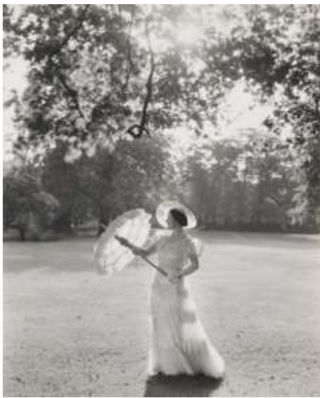
Cecil Beaton, Queen Elizabeth , 1939