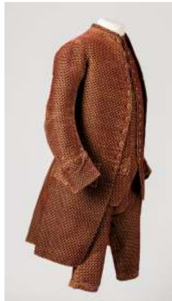
Possibly French, Court suit of coat, waistcoat and breeches , c.1760s