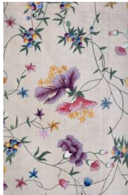
Chinese, Roll of hand-painted silk, c.1760s (detail)