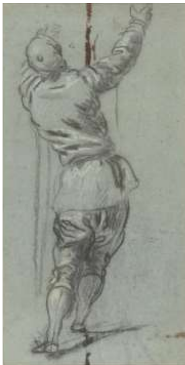
Jacopo Tintoretto, A man from behind , c.1555